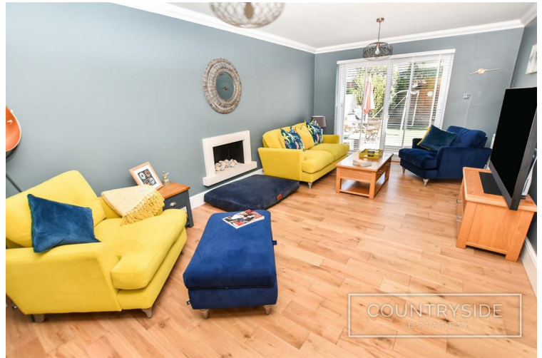
Lounge 19'10 x 11'6 (6.05m x 3.51m)

Patio doors to rear overlooking garden, oak flooring, recessed feature limestone fireplace with remote controlled pebble fire, two wall light points, two radiators.